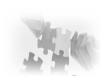
Master Data Management