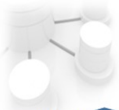
Cloud Data Integration

We do the heavy lifting, loading, validating, and standardizing your data. The result is cloud-based, integrated data to support your day-to-day sales operations activities. In addition, Aspect can serve as your operational service provider and perform key processing and analytical activities, making your organization compliant, efficient, and cost effective.