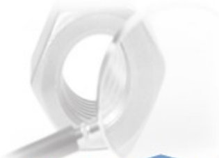
Business Intel Reporting